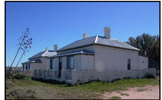
Heritage Cottages for all ages

"The world and all that is in it belong to the Lord;" Psalm 24