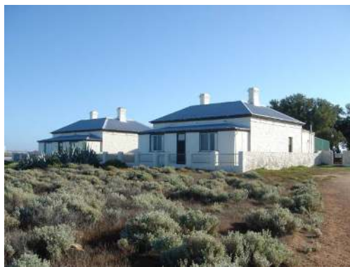
Pt Lowly Lighthouse Cottages

Every year FUUC travel to Point Lowly (near Whyalla) to observe the annual spawning/mating of the giant cuttlefish. It's some truly amazing diving observing these animals in huge numbers and there associated mating rituals and displays of colour. Diving is shallow (3-5m shore diving), with the water temperature typically being 12°C, so a good wetsuit (or drysuit for the fortunate) is required. If you haven't dived in water of this temperature, please have a chat to the trip co-ordinator to make sure you won't be too cold. We stay at the Point Lowly Lighthouse cottages, with accommodation costs being very cheap (current pricing will be advertised via the club mailing list before the trip).