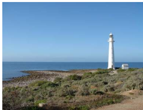
Pt Lowly Lighthouse