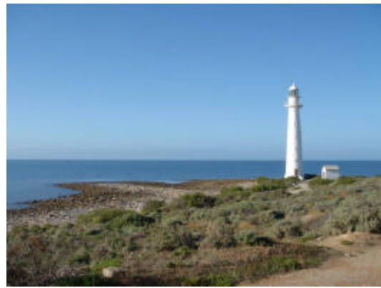
Pt Lowly Lighthouse