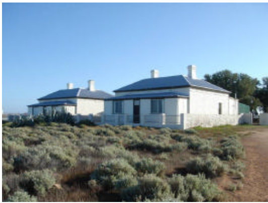
Pt Lowly Lighthouse Cottages

Every year FUUC travel to Point Lowly (near Whyalla) to observe the annual spawning/mating of the giant cuttlefish. It's some truly amazing diving observing these animals in huge numbers and their associated mating rituals and displays of colour. Diving is shallow (3-5m shore diving), with the water temperature typically being 12°C, so a good wetsuit (or drysuit for the fortunate) is required. If you haven't dived in water of this temperature, please have a chat to the trip co-ordinator to make sure you won't be too cold. We stay at the Point Lowly Lighthouse cottages, with accommodation costs being very cheap ($9/night students, $17/night non-students).